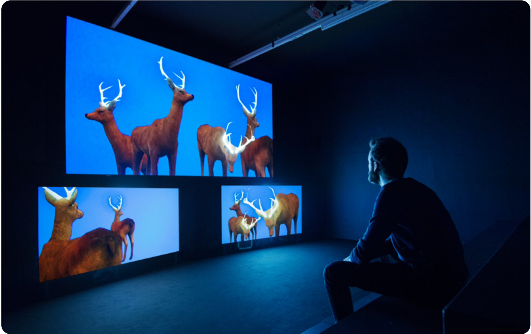
Global Windshield, the Musical. Installation view at at TENT, Rotterdam NL. (2018).