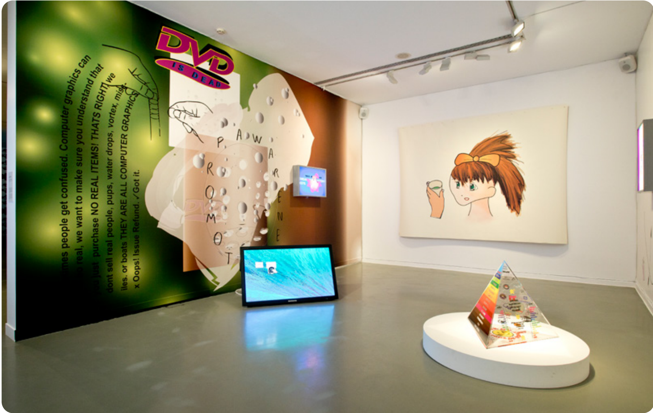
My Advice to Eva. Installation view at La Casa Encendida, Madrid ES (2019).