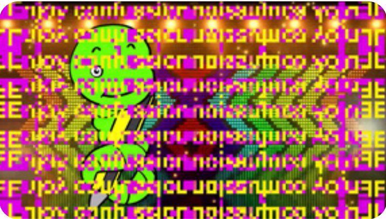
You Can't (frames)