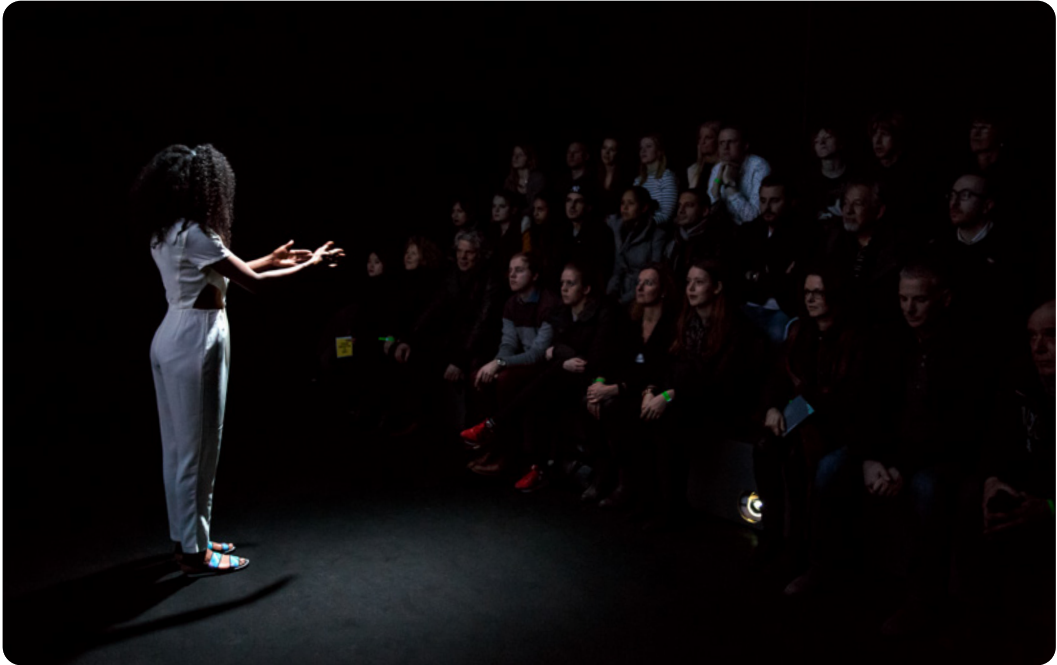
Global Windshield, the Musical. Performance at at TENT, Rotterdam NL (2018).