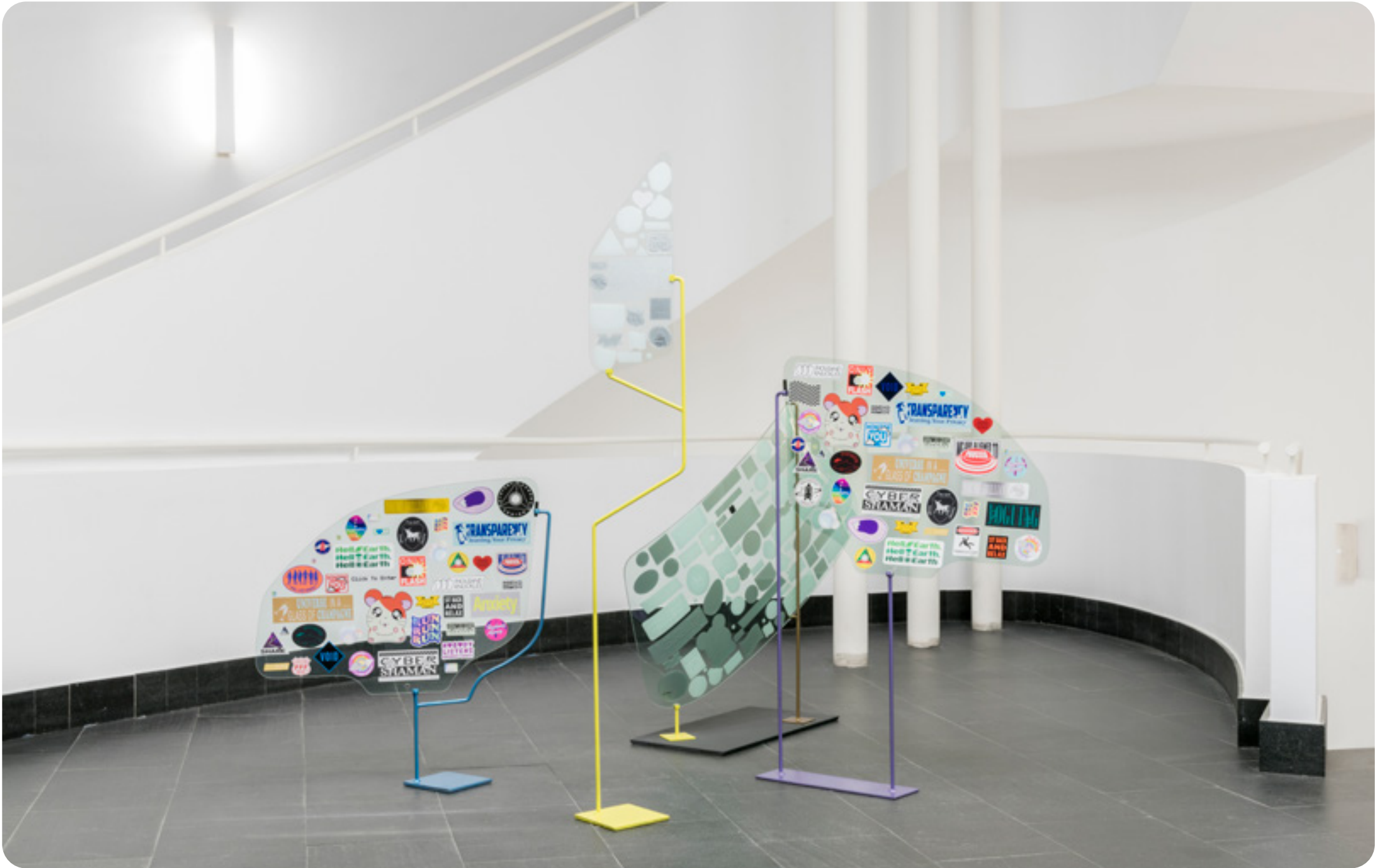
Windshield series. Installation view at CA2M ES (2018).