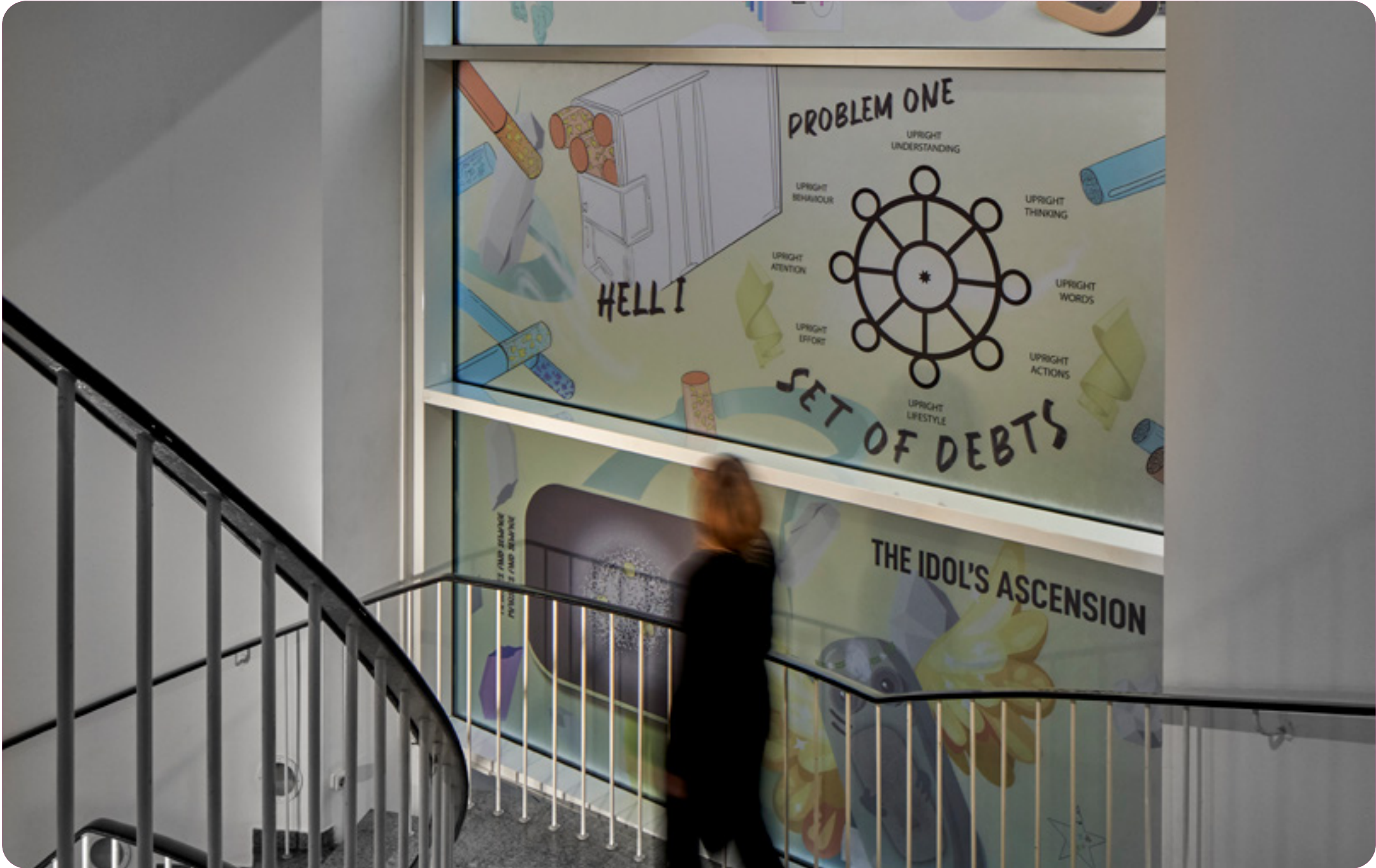
Calvary Chapel. Installation view at Frankfurter Kunstverein, Frankfurt DE (2022).